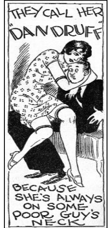
Cartoon from Capt. Billy's Whiz Bang, November 1929.

Both hockey and figure skating programs not only enhance each skater's skill and proficiency, the camp's emphasis is placed on sportsmanship and camaraderie.