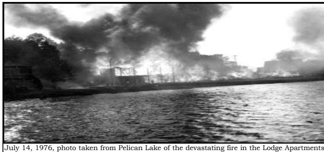
July 14, 1976, photo taken from Pelican Lake of the devastating fire in the Lodge Apartments