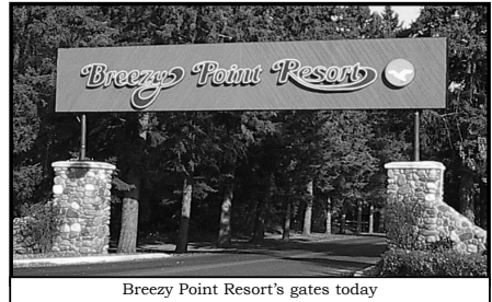
Breezy Point Resort's gates today