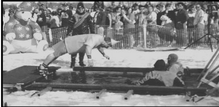
An airborne "plunger" at the 4th annual Polar Plunge.

Breezy Point Resort hosted the Polar Plunge on March 7, when a record 276 brave souls plunged into the 38-degree waters of Pelican Lake to raise $47,000 for Special Olympics Minnesota.