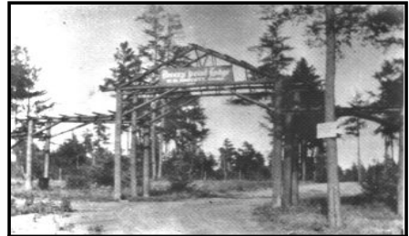
The primitive Breezy Point Lodge gates in the early 1920s.

The charges were placed and the ensuing explosion sent debris in all directions and, much to the chagrin of the greenskeeper, showered the adjacent golf green with rock and