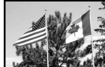
Flags at the Marina II.

Breezy Point Resort is truly an international destination. Our Canadian neighbors discovered the Resort years ago. Some are timeshare owners and others are attracted by the combination of the Resort's reasonable rates, attractive packages and the favorable currency exchange rates. These factors have made it their Resort of Choice. courses and courteous staff as reasons he returns. He then laughed and said it was really impressive that the staff had learned to speak Canadian!