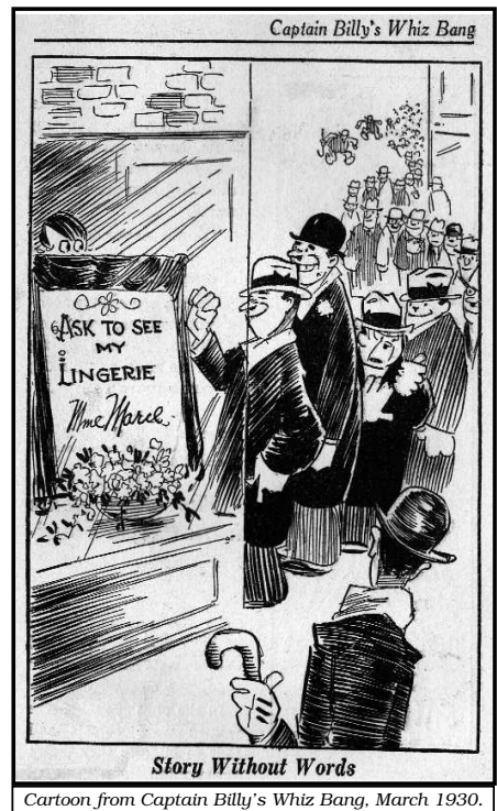
Cartoon from Captain Billy's Whiz Bang, March 1930.