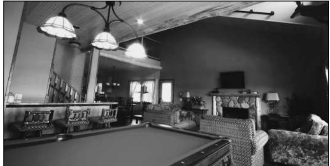
The Boat House has four bedrooms, four baths, a fireplace and a rooftop deck! This lake home is perfect for golfers, families and gatherings of all kinds.