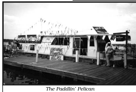
The Paddlin' Pelican