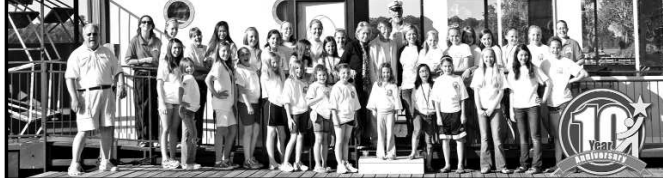
Participants at the Father-Son Weekend Camp