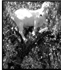
A goat in a tree on Gooseberry Island

No matter what the effects of your trauma, we can help you. The effects of a childhood goat trauma vary widely from person to person, depending on the