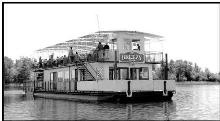
The Breezy Belle