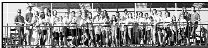
Point of Perfection participants onboard the Breezy Belle.