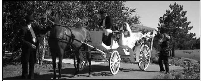
We can help you make your wedding experience truly memorable.

A true northern Minnesota lakeside resort, Breezy Point Resort has event space, a wide variety of lodging and dining options, as well as a long list of recreational and entertainment choices.