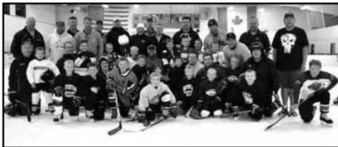
Participants at the Father-Son Weekend Camp

The Breezy Point Ice Arena had another successful Summer Camp season.