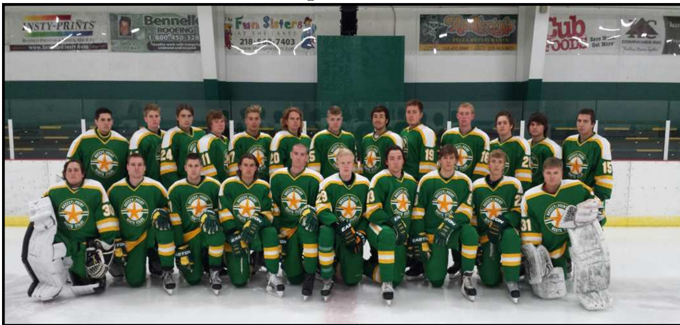
The 2013/2014 Breezy Point North Stars Team