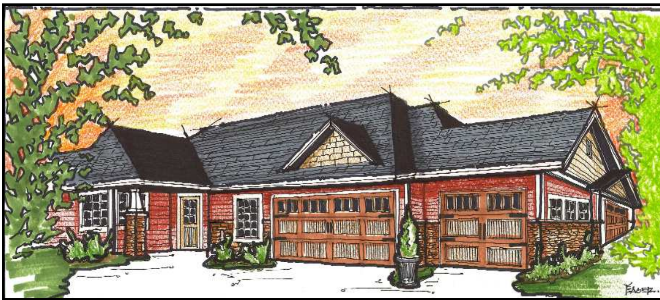
Artist's rendering of a new unit in Breezy Point Resort's Whitebirch Village.

The time has come! Last fall ground was broken for Whitebirch Village. This project, an active adult housing development, is being built by Dotty Bros. Construction of Pequot Lakes. The first units will be available in May including model homes furnished by Callan Furniture. It is perfectly situated on 24 acres of scenic land on the #10