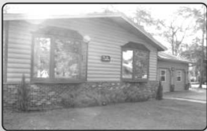
LOVELY BREEZY POINT HOME WITH RENTAL OPTIONS MLS# 4416416 $235,000