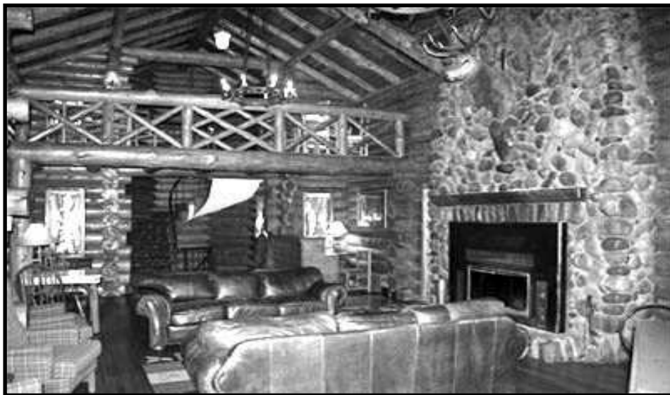
The Fawcett House, the 11-bedroom log mansion built in the 1920s by "Captain Billy" Fawcett, hosts family reunions and groups in style.

Your Girlfriend Getaway package includes two nights lodging in Breezy Inn and Suites or Whitebirch Estates, breakfast each morning and choice of the menu dinner one evening in the Marina II Restaurant, two free cocktails in Dockside Lounge and a 20% discount on all NON-sale clothing in the Gift Shop, Whitebirch Pro Shop and the Traditional Pro Shop. Girlfriend Getaway prices start at $149 per person, double occupancy.