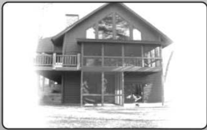
6 BDRM RENTAL HOME ON DEACONS MLS# 4400668 $279,900