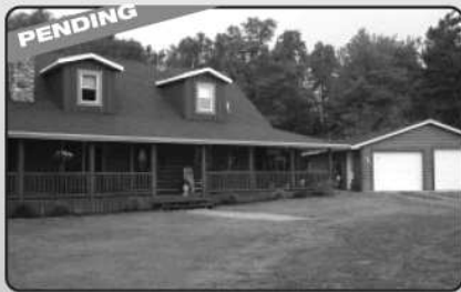
17.5 ACRE HOBBY RANCH AND LOG HOME MLS# 4406325 $275,000