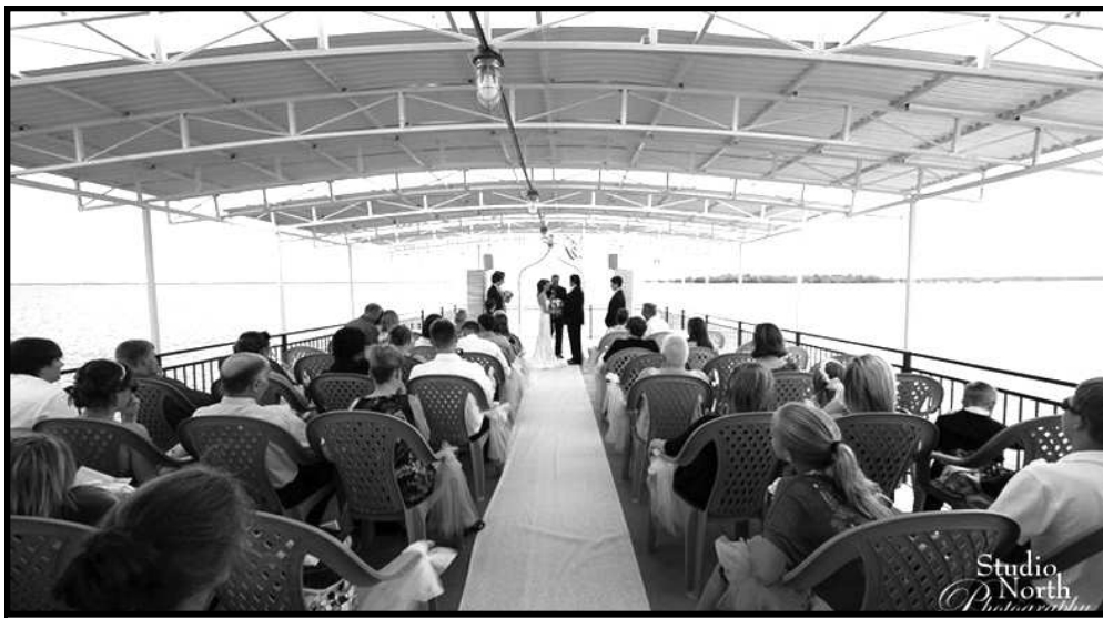
The bride and groom exchange their vows on the Breezy Belle.

2013 saw another season of growth for the Breezy Belle. This 100-passenger genuine paddle wheeler hosted over 3700 passengers on her scheduled and chartered sailings.