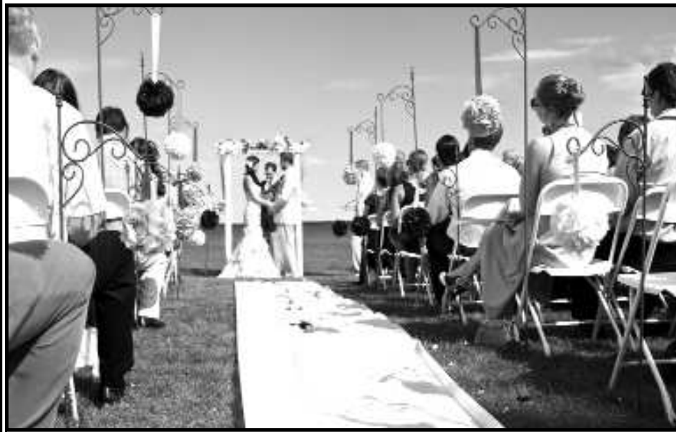
Breezy Point Resort can help you make your wedding experience truly memorable.