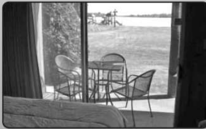
LAKESIDE LODGE APARTMENT MLS# 4363701 $164,900

For reservations, information or ideas on how to make your vacation truly memorable, call 800 432-3777 or visit us on the web at www.breezypointresort.com .