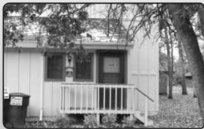
GREAT RENTAL INCOME OR VACATION GETAWAY MLS# 4426784 $96,000